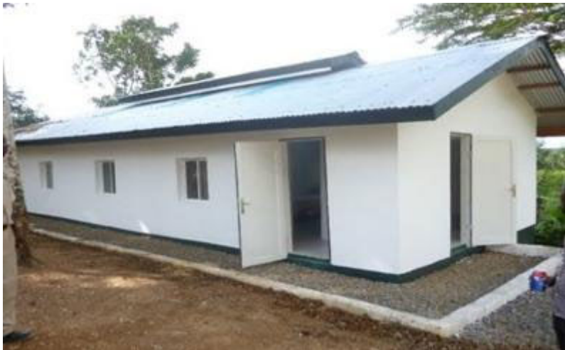
Ebola/Covid isolation unit