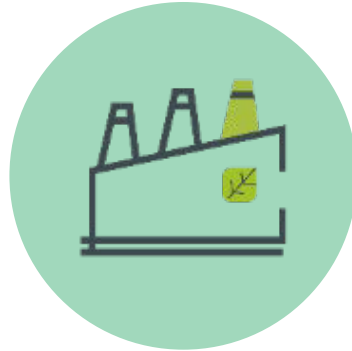
Hydro power plant USD 15 million