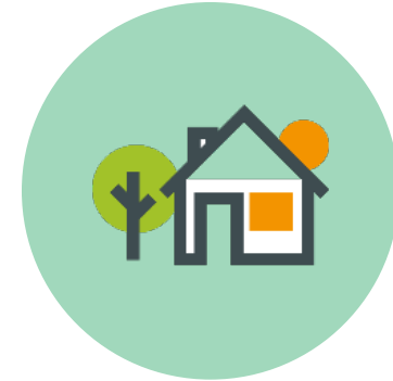
Housing, equipment, vehicles USD 57 million