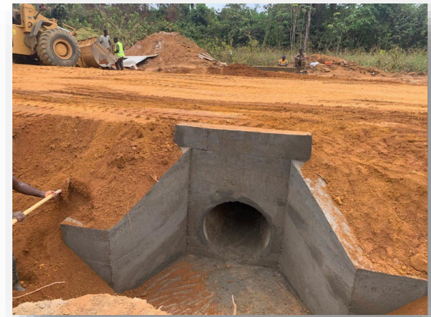
Maintenance of LAC/Buchanan Road