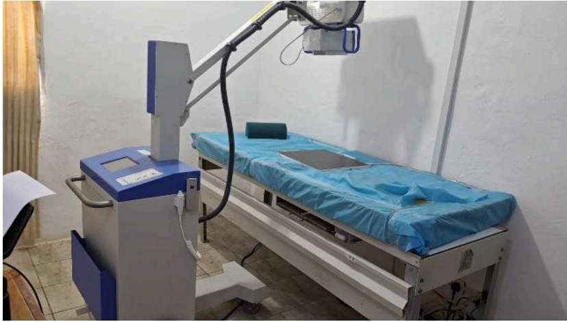
New digital X-Ray machine