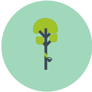
Extension & Replanting USD 42 million