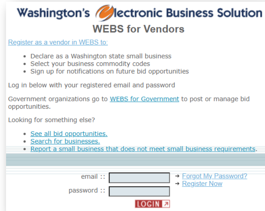
Screenshot of the WEBS login